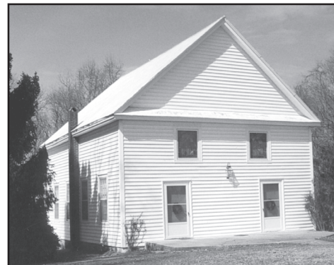
Rough Creek Presbyterian Church

The Church of England erected the first chapel at Rough Creek in 1765. After the American Revolution in 1765, the Methodists organized the church. Rough Creek was received into the care of the